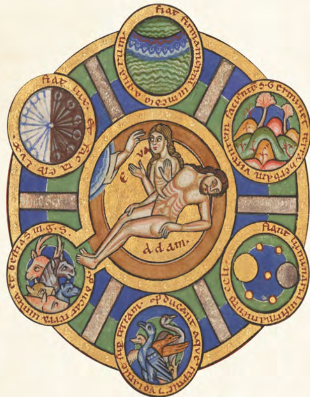
Detail, Anonymous, The Creation of the World , Germany, c. 1170s