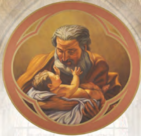
St. Joseph Photo © danny izzo, nouveau photoau St. Joseph Painting © Wil Kolstad, Conrad Schmitt Studios